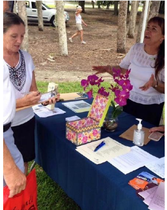
A local resident fills out a postcard, showing her interest in learning more about AAUW Vero Beach

This is the fourth year AAUW Vero Beach has had a booth at the Cultural Council Arts Festival, and each year this event is a better source of recruitment for new members. Our member volunteers left the festival with 29 completed post cards! These women also got an events brochure and will be on our email list to be reminded of our programs.